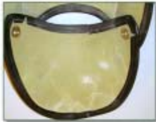
Close-up of backside shows no penetration.