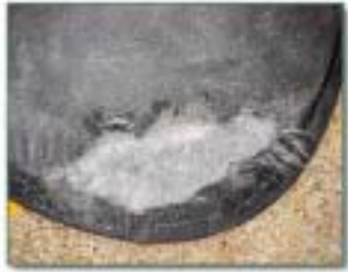
Only first layer had any penetration.

WaterArmor saved an operator in a recent accident when he swiped his foot at 36,000 psi (2,500 bar) with a rotating lance. There was no penetration to the backside of the gaiter.